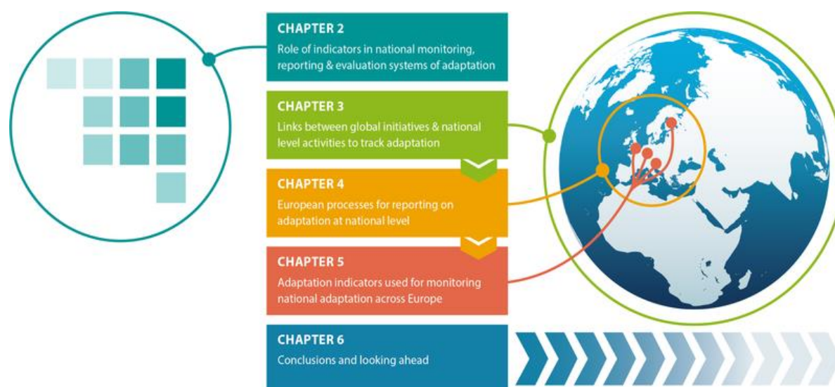
Figure 1.2: Visual representation of the structure of the present ETC/CCA Technical Paper